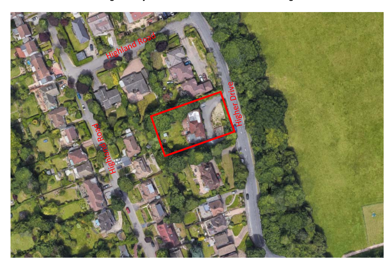
Aerial view of site