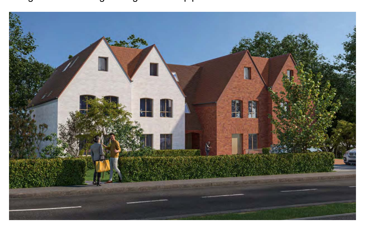
Computer Generated Image of proposed development

8.14 The proposal is considered to comply with policies SP4.1 and DM10 and London Plan policy D3 as it is of an appropriate height and mass and a high design quality which responds appropriately to its context and contributes positively to the streetscene.